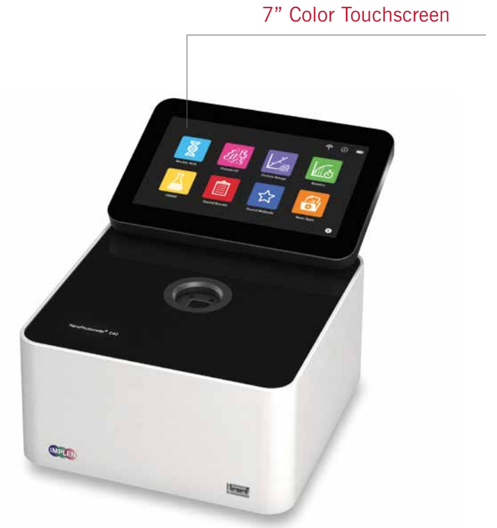
7" Color Touchscreen